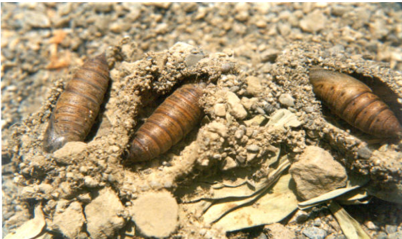
( ) Hyles euphorbiae